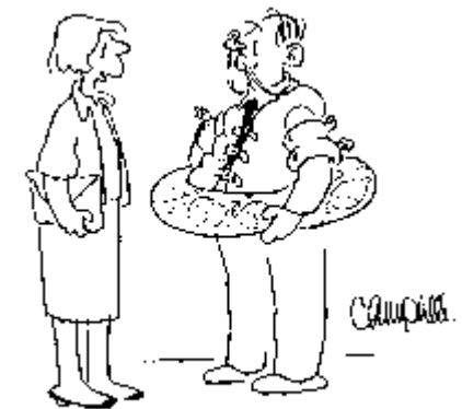
"Ed! You've decided to be baptized!"