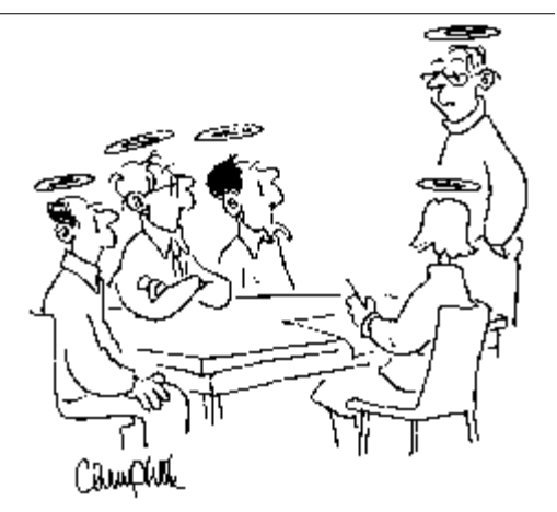
"Before we get stanted, let's say a little prayer for humility."

June 10th and 11th, "WoodLawn," July 8th and 9th, "God's Not Dead," August 12th and 13th, "God's Not Dead 2" Donations will be accepted to help offset some of the costs of being allow to show the movies to the general public. Make plans to take the whole family. It will be a wonderful and fun Family Night!