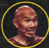
FRANCIS CHAN Church Planter and Bestselling Author