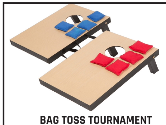
BAG TOSS TOURNAMENT