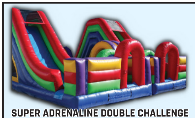
SUPER ADRENALINE DOUBLE CHALLENGE

FOLLOWING THE MEAL ... LET THE FUN & GAMES BEGIN!