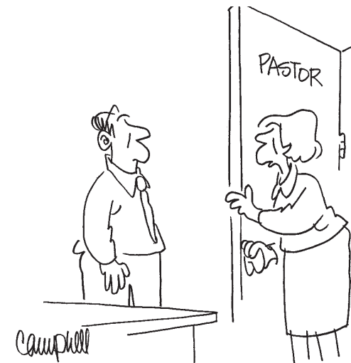
"The VBS director says that Armageddon has occurred in the third-grade classroom and she quits."

The next Leadership Council meeting will be May 21 at 6:00 p.m. Trimester Business Meeting June 23