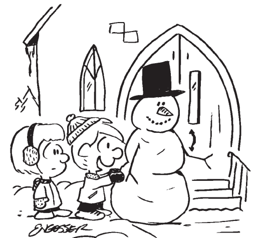
"He's today's greeter."